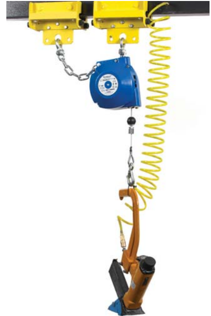
EB Model, Trolley Nail-Gun Application