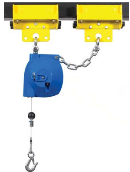
EB Model, Rear View, Trolley Application