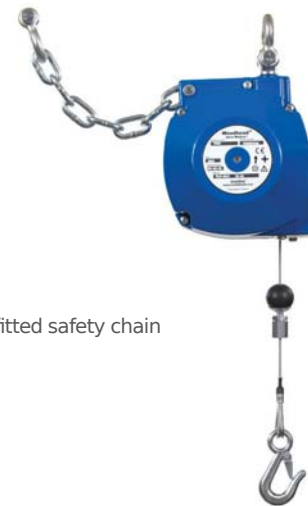
EB Model Balancer, Front View

Dimensions and Weight for Reference Only [±5%]. Subject to change without notice.