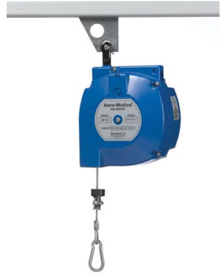
BF / BFL Models