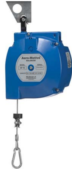
BF / BFL Model