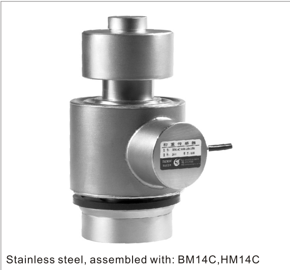
Stainless steel, assembled with: BM14C, HM14C

Easy installation, good self-aligning ability, anti-reversal ability. Stainless steel construction, anti-corrosion, can be used under hazardous environments. Mainly used for platform scales, automobile testing facilities, electronic truck scales and other electronic weighing devices.