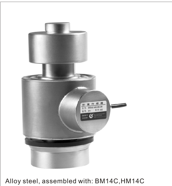
Alloy steel, assembled with: BM14C, HM14C

Easy installation, good self-aligning ability, anti-reversal ability. Mainly used for platform scales, automobile testing facilities, electronic truck scales and other electronic weighing devices.