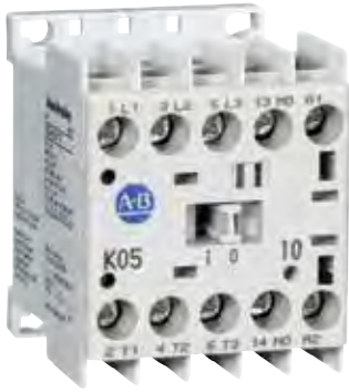
100-K IEC Contactor

The Bulletin 100-K miniature contactors are designed for commercial and light industrial applications where panel space is at a premium. These miniature devices, while 45 mm wide, are shallower and have less panel depth requirements than standard IEC contactors.