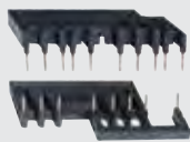
Reversing wiring kit