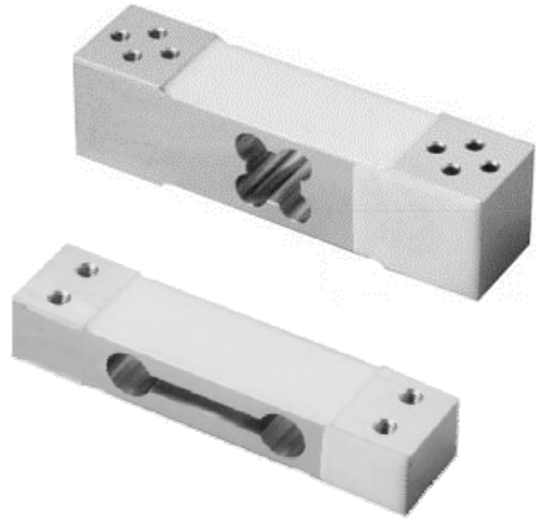
silicone free version with black pottant

with electrical output for tension and compression forces