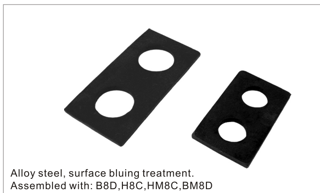
Alloy steel, surface bluing treatment. Assembled with: B8D,H8C,HM8C,BM8D

Mainly used for platform scales, floor scales and other electronic weighing devices.