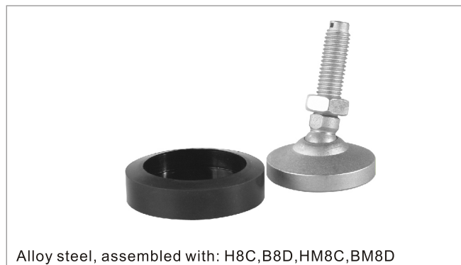
Alloy steel, assembled with: H8C,B8D,HM8C,BM8D

Easy installation, automatically centralized inside, good ability of anti-side loading. Mainly used for platform scales, floor scales and other electronic weighing devices.