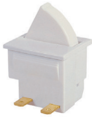
H3145AA - - -