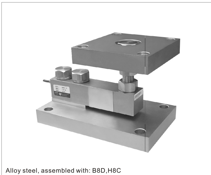
Alloy steel, assembled with: B8D,H8C